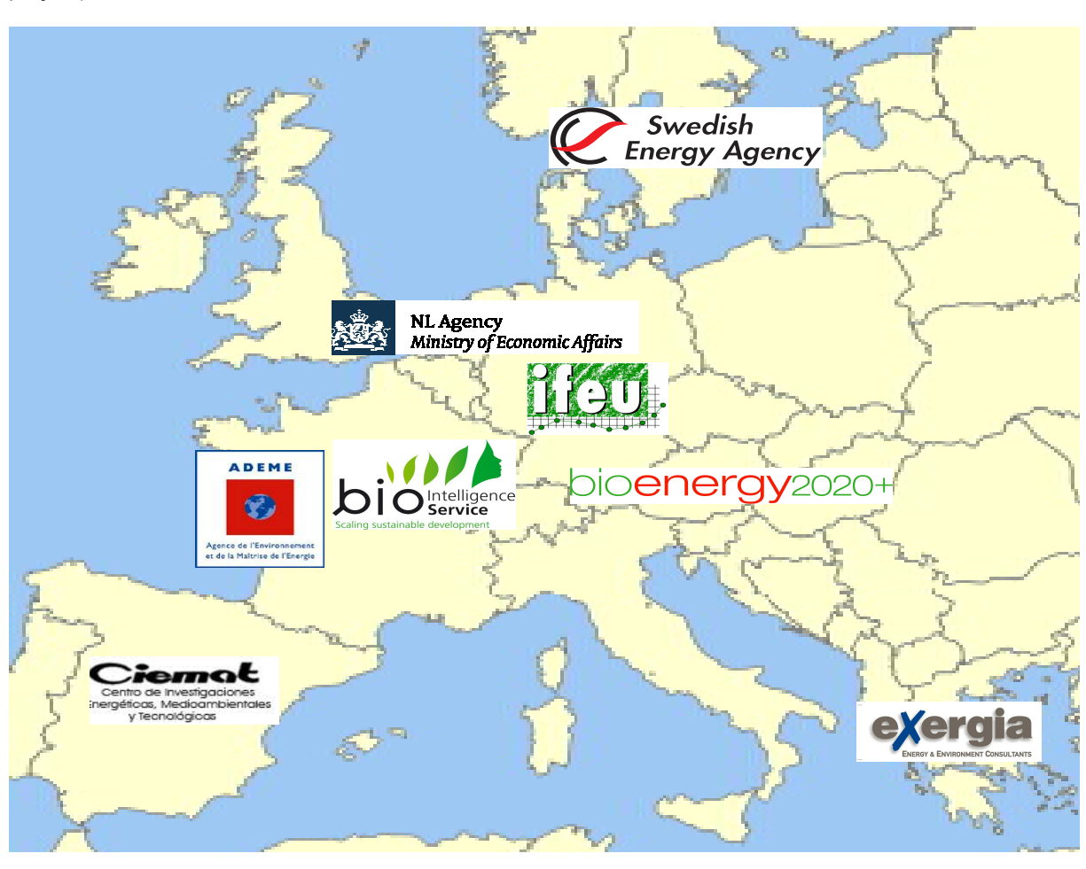
Table 1 below gives the contact details (addresses, phone numbers and e-mail addresses) for the contact persons of the BioGrace project partners.

The BioGrace project was performed by 8 project partners from 7 EU member states, as listed in the figure below. The project was coordinated by Agency NL (SenterNovem at the start of the project).