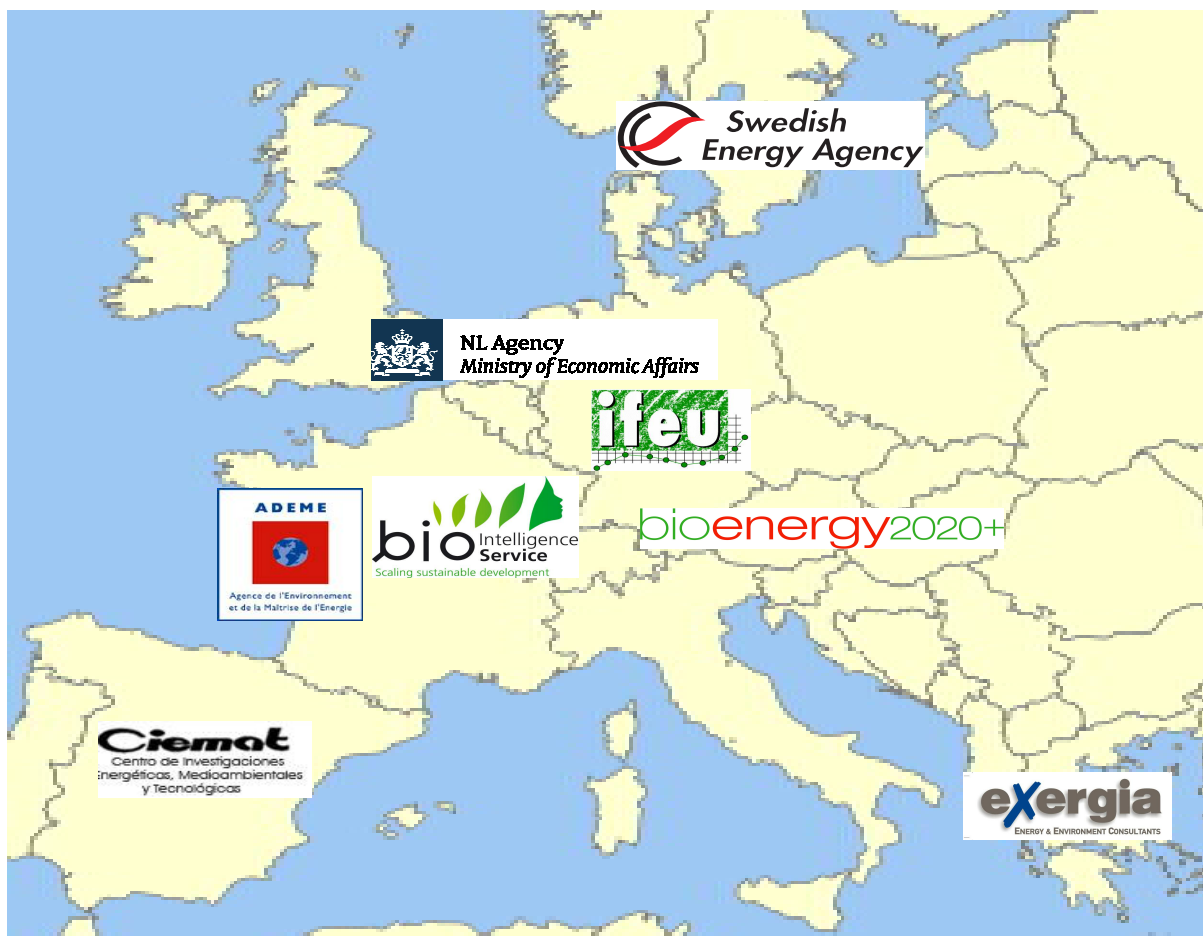
Table 1 below gives the contact details (addresses, phone numbers and e-mail addresses) for the contact persons of the BioGrace project partners.

The BioGrace project was performed by 8 project partners from 7 EU member states, as listed in the figure below. The project was coordinated by Agency NL (SenterNovem at the start of the project).